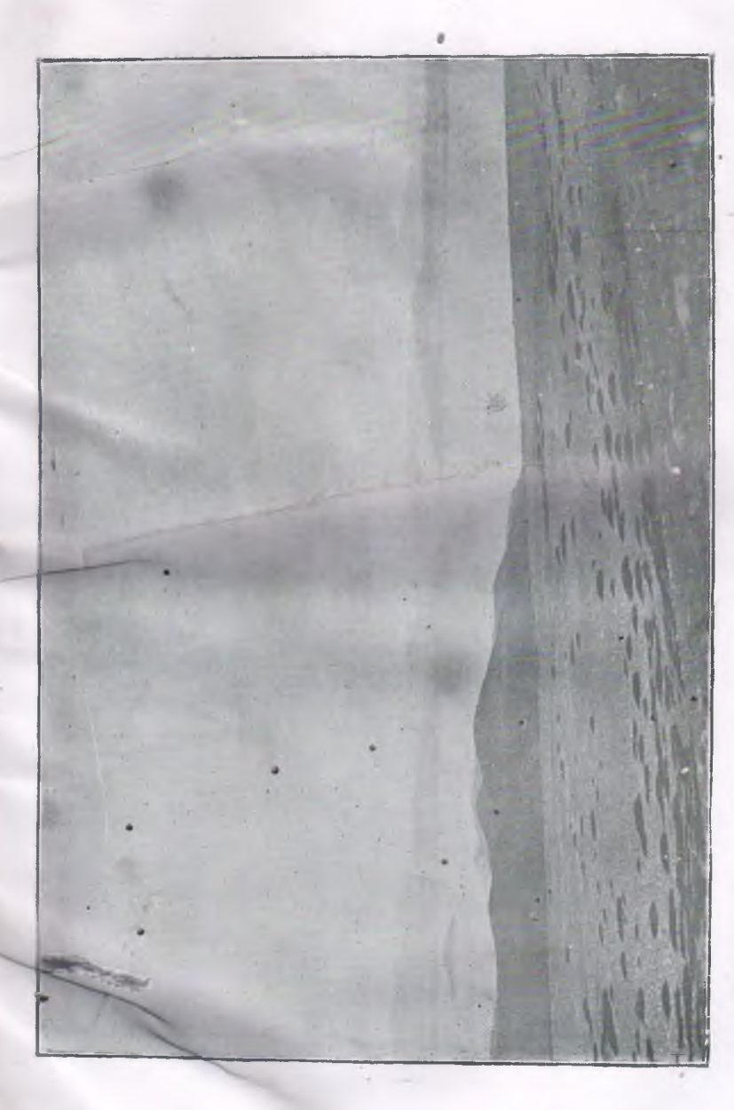
Plate III. Clumps of Caragana pyzmæa near Rakastal lake, Western Tibet. About 15,000 feet.