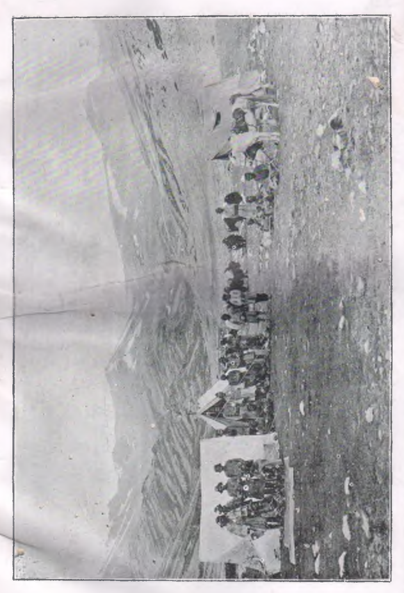
Plate VI. Campat Rukchin (Rupshu, Ladak) nearly 16,000 feet; shows the average general view of the country.