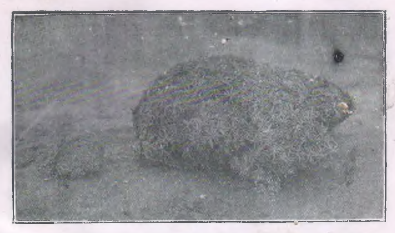
Arenaria Musciformis (small), Acantholimon lycopodicides (lerge) Ladak. About 12,000 feet.