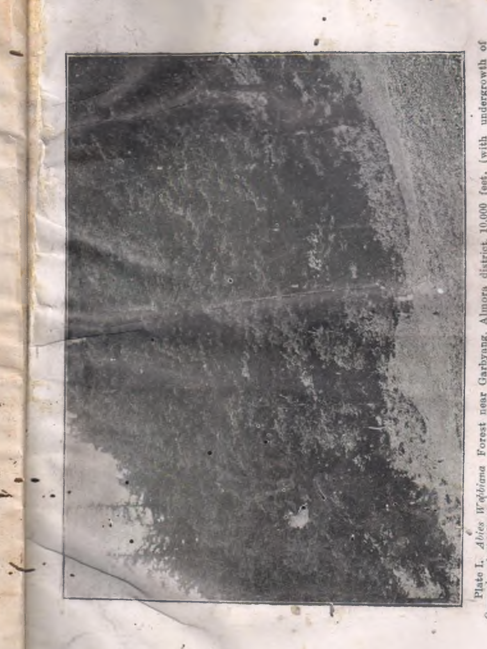
Plate I. Abies Woldiana Forest near Garbyang, Almora district, 10,000 feet. (with undergrowth of