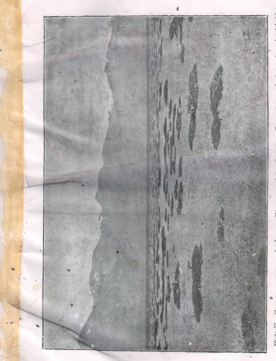
Plate II. Caragana pigmwa, bushes on Kiang tso plain, Rupshu. Two plants of Arenaria polytrichoides in the middle foreground. About 15,000 feet.